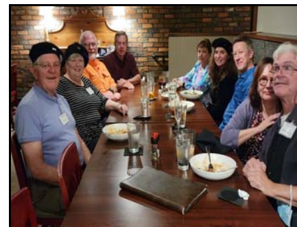
Looks like the Bondurant group gets a gold star for cleaning their plates! A good time was had by all!