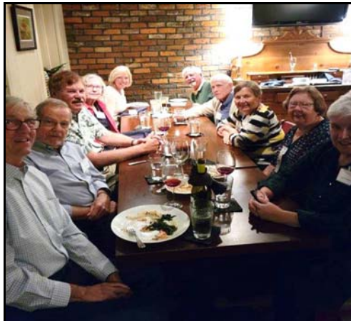
Milner’s Restaurant served a delicious meal to some hungry Bondurants on Saturday evening!