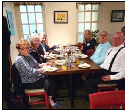
More hungry Bondurants enjoyed their meal at Milner’s, too!