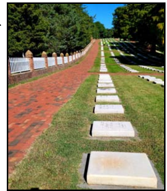
God's Acre at Salem - the Moravian cemetery.