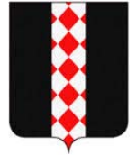
Emblazon of Génolhac, France