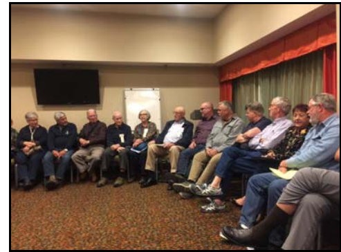
Introducing ourselves at the Meet & Greet on Friday evening.