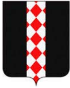
Emblazon of Génolhac, France